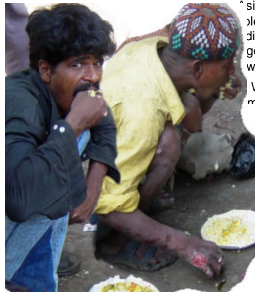
Ministering on the street with India Teen Challenge, we fed addicts whose bodies were covered with scabies and abscesses from dirty needles

While we rejoice in all of the victories of 2005, we are believing God for an even greater year in 2006.